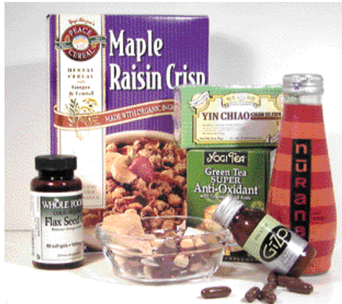
From left to right: Flax seed oil capsules, a source of omega 3's, Herbal cereal with ginger and fennel to aid in healthy digestion, Yin Chiao an herbal preventative, Green Tea as an Anti-Oxidant, Gizo "kava shooter" for relaxation and focus, and Nurana which contains kola nut, guarana and green tea for energy. Front: Soup mixture of dry abalone, lycii, dioscorea, lilly bulb and lotus seed to aid in overall health.

And finally there is soy. "Soy represents a tremendous opportunity in the food industry. CBS MarketWatch reported that by 2005 soy milk sales should hit the $1 billion mark, from the current $420 million, while total soy